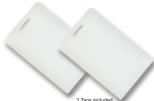
2 Tags included part # HAA2866/TAG