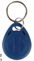
optional access badge part # HAA2866/TAG2